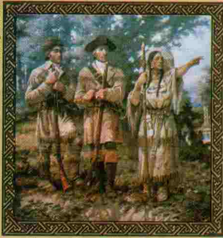
Sacagawea, a Shoshone Indian, guided Meriwether Lewis, William Clark, and the Corps of Discovery as the group made its way to the Pacific Ocean.

On January 18, 1803, the third U.S. President, Thomas Jefferson, sent a letter to Congress. He asked the members of Congress to give him $2,500. He wanted to send a party of adventurers to explore the western areas of the United States. The money was used to pay Meriwether Lewis and William Clark to map a route to the Pacific Ocean.